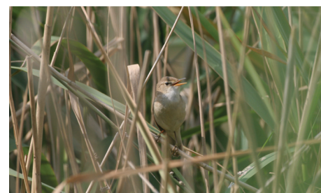
A Reed warbler spotted as part of the ornithological survey.

Further survey work will continue to gather more information along the proposed cable route and at the converter station sites. The collected data will be extensively analysed and made public later in 2013.