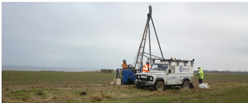
Borehole surveys, such as this one pictured, will be undertaken as part of the continuing work.