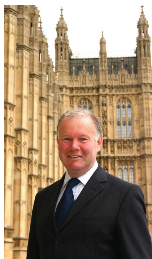
New chairman Charles Hendry.