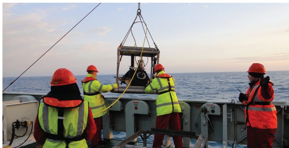
Unparalleled data has been gathered during surveys.