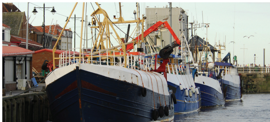
Fisheries Update will keep fishermen informed of Dogger Bank developments.

Forewind has published its first edition of Fisheries Update, a newsletter launched to keep those involved in commercial fisheries informed about the latest activity on the Dogger Bank development.